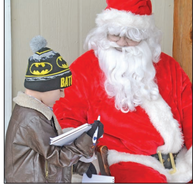
Santa with a young Batman fan at the Kris Kringle Market on Saturday, Dec. 3.