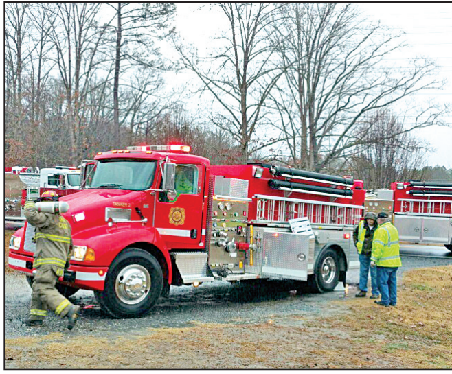
Firefighters responded to a house fire the morning of Sunday, Dec. 4, off old Blue Ridge Highway. The fire was quickly put out and no one was hurt.